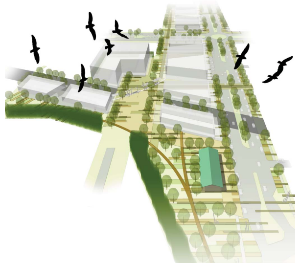
View from Braithwaite Street